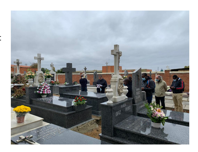
During our prayer in the cemetery in Palencia

It is my hope that this brief picture does give a simple picture of our Unit of Spain. It is of utmost interest for me to keep sharing with you about the life and activities here in our Unit.