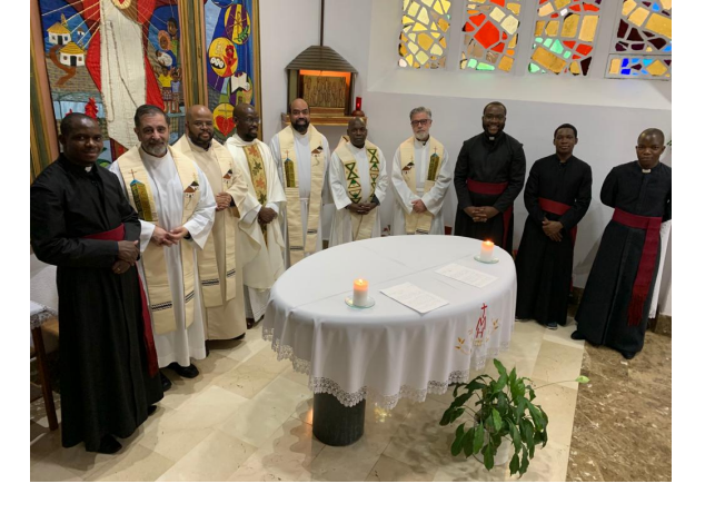
The Photo family after Mass in 2nd of February

As some of you might be aware, in this region we are one of the smallest units in the congregation. We are 11 in total from different countries: 7 priests and 4 student priests and the countries of our origin being, Spain, Panama, Mozambique, Zimbabwe, South Africa and Kenya. We have 2 houses in the unit: in Madrid which is the provincial house with 4 members and Salamanca which is our formation house with 7 confreres. The students go to the Pontifical