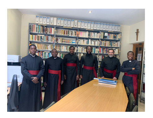
The Formators and Formees