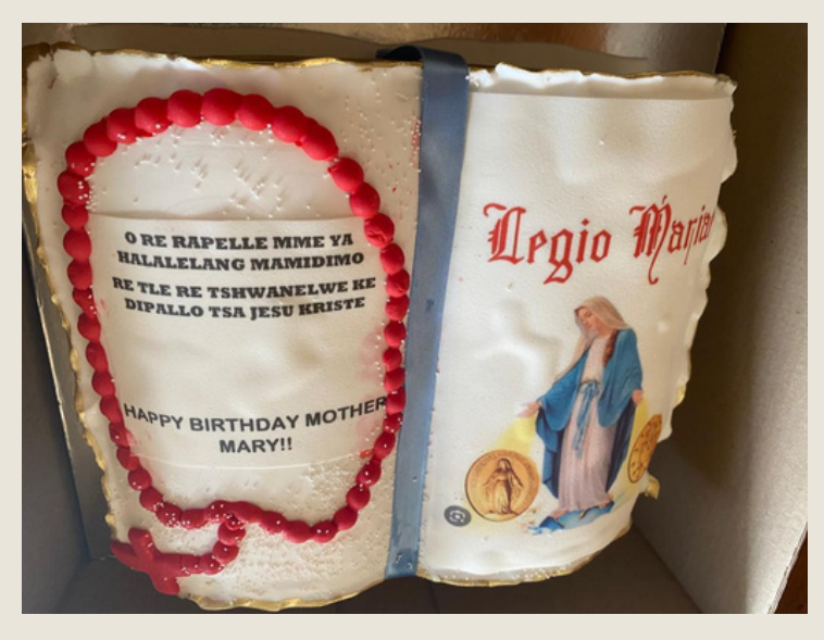
The Cake of the Feast of the Nativity of our Blessed Mother.

The Legion of Mary together with the community of Hardenberg parish celebrated the feast of the Nativity of the Blessed Virgin Mary. Below are the pictures of the celebration.