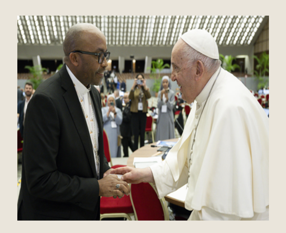
BISHOP THULANI VICTOR MBUYISA CMM WITH HIS HOLINESS POPE FRANCIS DURING THE XVI ORDINARY GENERAL ASSEMBLY OF THE SYNOD OF BISHOPS.