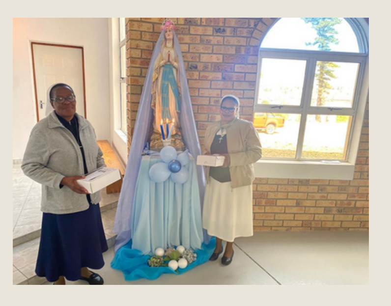
FCSCJ Sisters who belong to the community of Hardenberg on the day of the celebration.