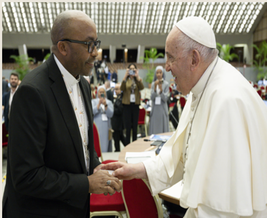
BISHOP THULANI VICTOR MBUYISA CMM WITH HIS HOLINESS POPE FRANCIS DURING THE XVI ORDINARY GENERAL ASSEMBLY OF THE SYNOD OF BISHOPS.