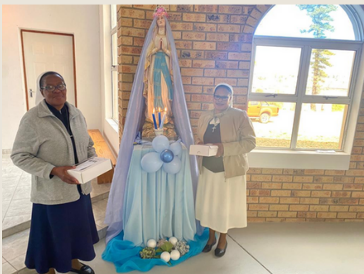
FCSCJ Sisters who belong to the community of Hardenberg on the day of the celebration.