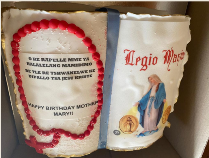
The Cake of the Feast of the Nativity of our Blessed Mother.

The Legion of Mary together with the community of Hardenberg parish celebrated the feast of the Nativity of the Blessed Virgin Mary. Below are the pictures of the celebration.