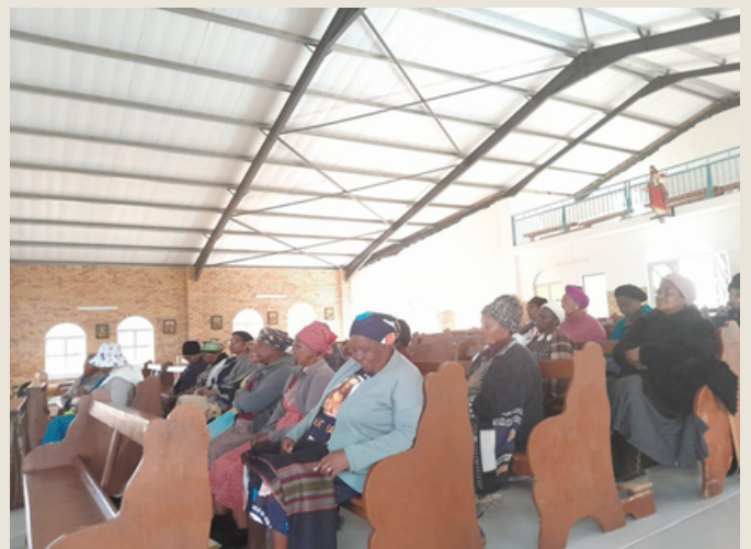
Different Sodality members were present on the day of the celebration. Sodalities such as Kemolo and St Anna.